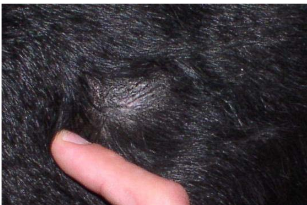
Fig. 1. Left elbow, multiple tubercles.