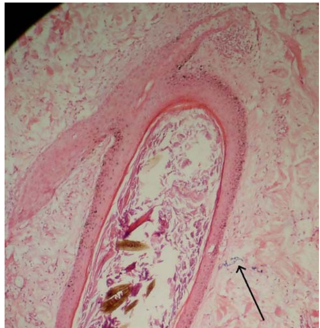
Fig. 3. Histopathological examination, microabscesses, granuloocyte infiltration and filamentous branching bacteria (arrow) are present. (stain H-E, x 100)